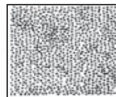
1.711 microns (1500) FreeFlo Copper